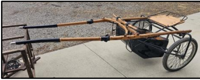
A Sized Mini Horse Show Cart