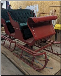
Red & Green Sleigh