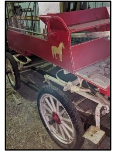
Pony Hitch Wagon