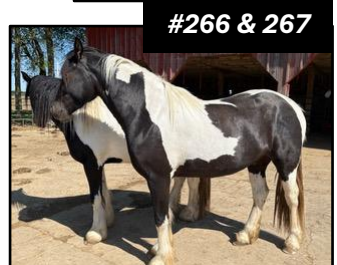
#266 & 267