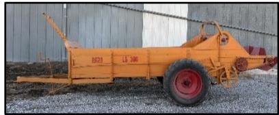
Minneapolis Moline Spreader