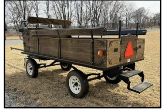
Weaver Wagon. Like New. Comes w/ Cover Fitting Entire Wagon.